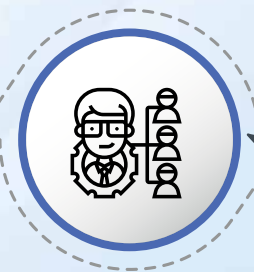
Human Resource Manager